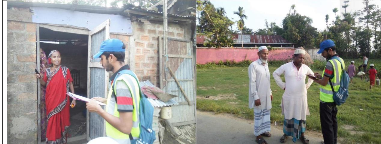
Interview with housewife and community People