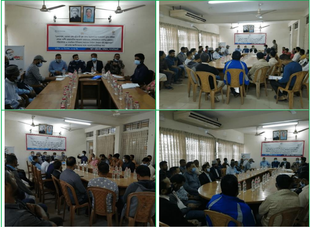
5 Figure: Consultation Meeting, Burimari Land Port, Burimari, Patgram, Lalmonirhat