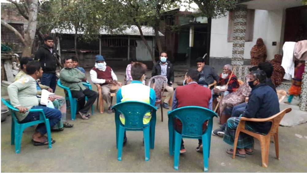
Picture: FGD with Community male near zero point