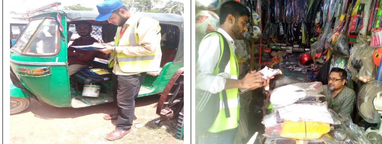
Interview with CNG Driver and Businessman