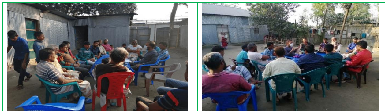
7 Figure: FGD with community male