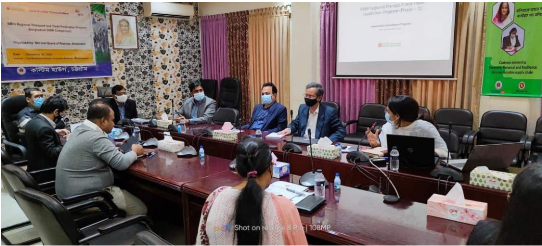
Photos from the Stakeholder Consultation Meeting, Custom House, Chattogram