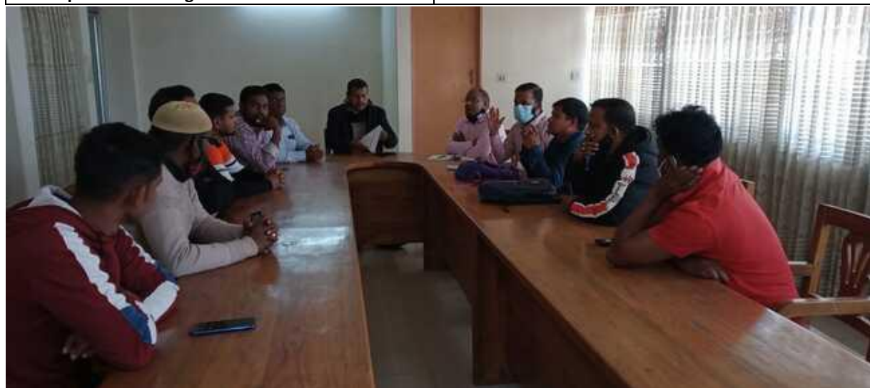
6 Figure: FGD with Importer and C&F agent representatives