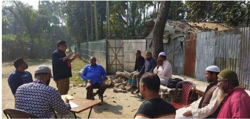
8 Figure: FGD with Community elite person