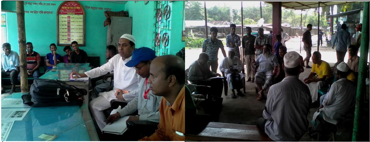
Focus Group Discussion (FGD) Meeting