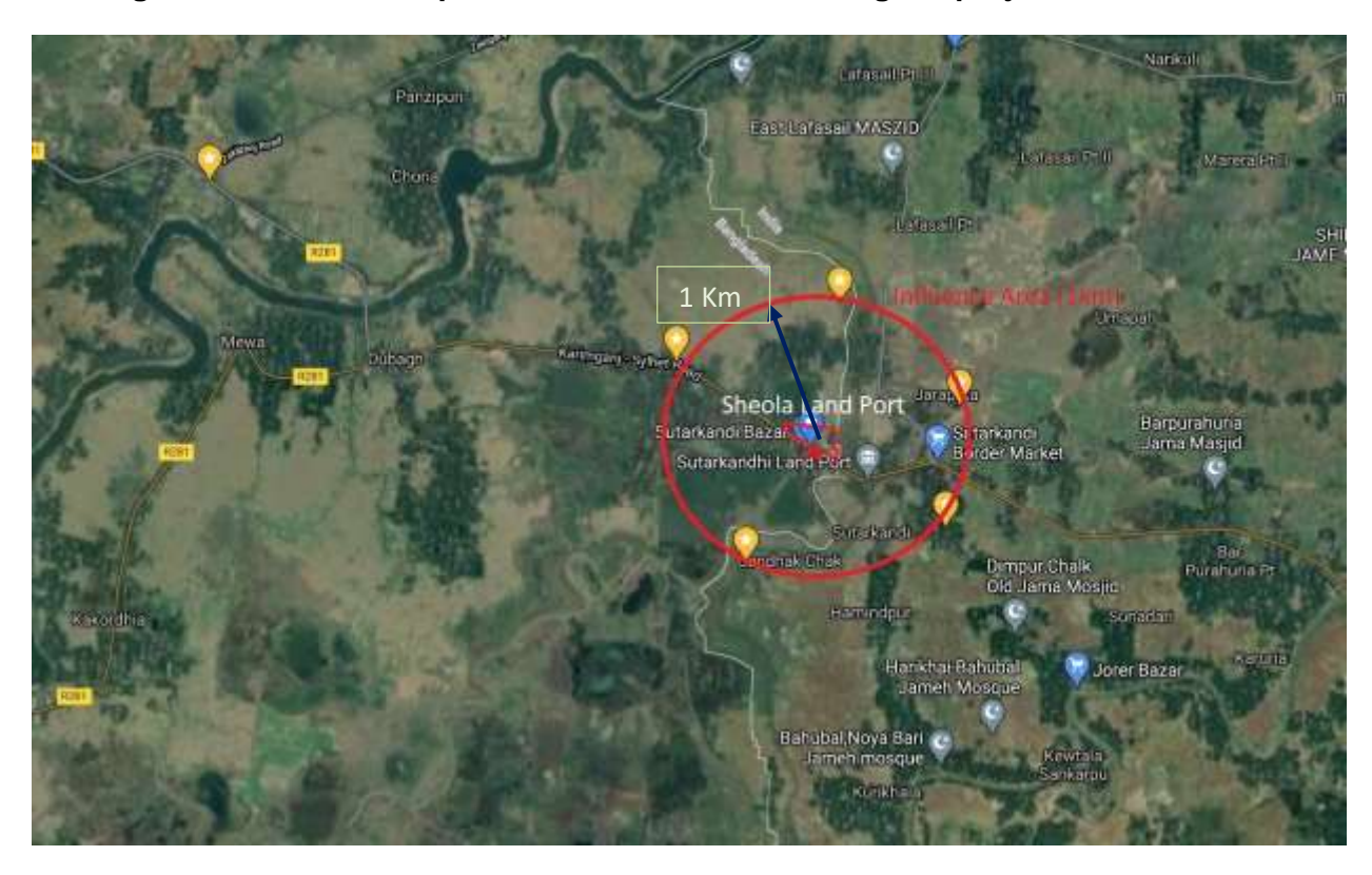
Figure 1.1: Satellite Map of Sheola Land Port showing the project influence area

The general physiographic area is shown in Figure 1.1. The area is mostly plain and floodplain land. Most of the proposed area for Sheola land port is located in the catchment area of Kushiyara River. A rainwater drain flowing through the area carries the flood waters to the Kushiyara River. The areas south of the land port will drain to the in land drainage basin, Murihahaor.