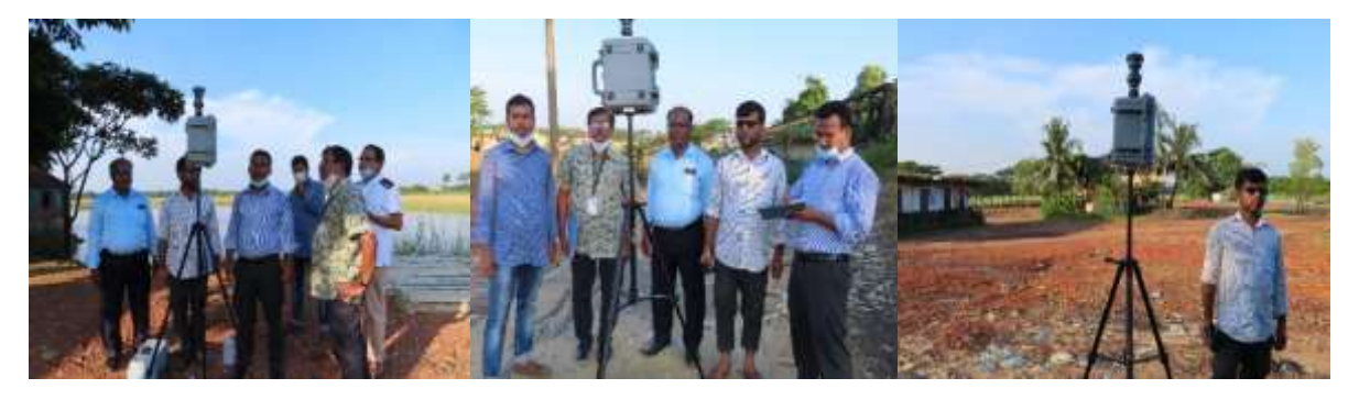
Air Quality Water Sampling from (from left) Close to BGB Camp and adjacent to Sutarkandi Bridge