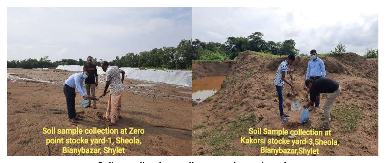
Soil sampling from adjacent to the project sites